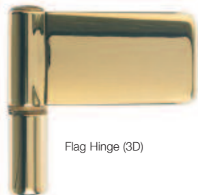
Flag Hinge (3D)