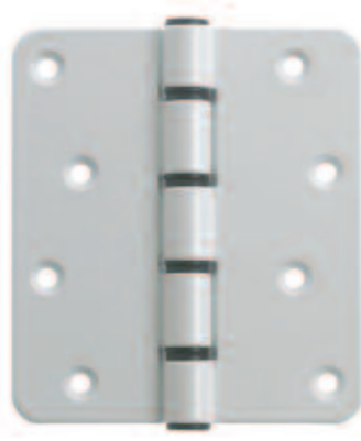
Butt Hinge (Composite)