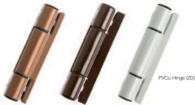
PVCu Hinge (2D)

of finishes as the other products in the Overture range. All are manufactured to the highest standards. Please phone for the latest availability.